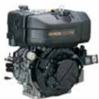
KOHLER 9.1 HP Kohler Diesel KD-440

NOTE: Only pressure lubricated units are capable of 250 PSIG operation. Units tested in accordance with CAGI/PNEUROP Acceptance Test Code PN2CPTC3. Dimensions are for R-Series compressors. Add 1" to the width for PL units.