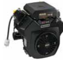
KOHLER 20 HP Command Pro CH640