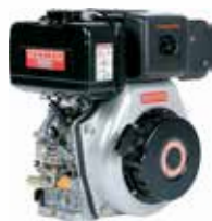
YANMAR 9.1 HP L100V