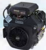
KOHLER 23 HP Command Pro CH680