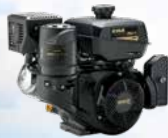
KOHLER 14 HP Command Pro CH440