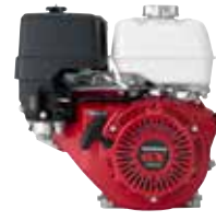
HONDA 13 HP GX390